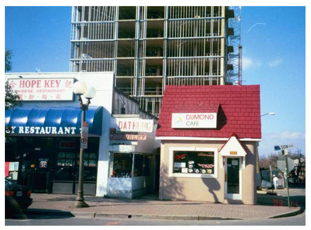
Figure 6. Dwarfed by the former Little Tavern building (at right in the photo, now Dumond Café), Dat Hung jewelry is a tiny Vietnamese storefront that has been in operation since the late 1970s.