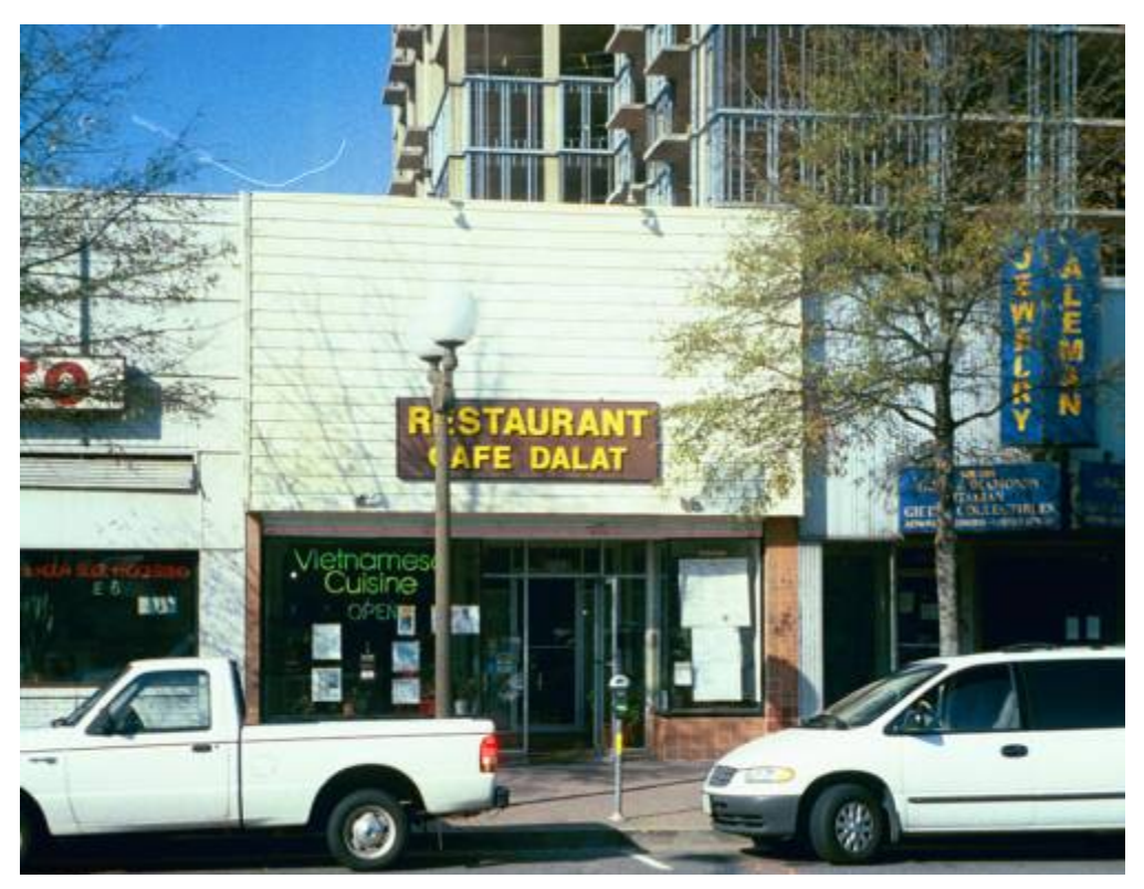
Figure 5. Café Dalat can be found in a section of one-story storefronts that once housed several Vietnamese establishments. This building used to be the Kim Long store, which offered various Vietnamese goods for sale.