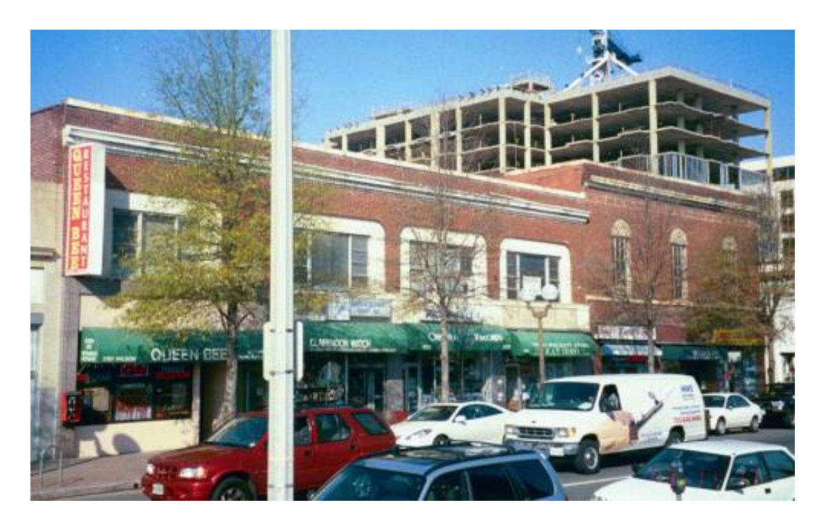
Figure 1. The Rucker Building, built in 1925, still houses the Queen Bee Vietnamese restaurant, seen at the left. Note the high-rise development going up behind the historic structures.