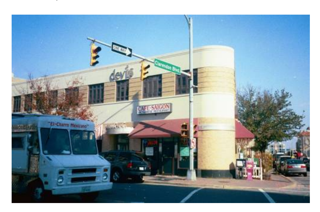
Figure 4. The 1939 Underwood Building, a Streamline Moderne structure that now features one of Clarendon's still-successful Vietnamese establishments.