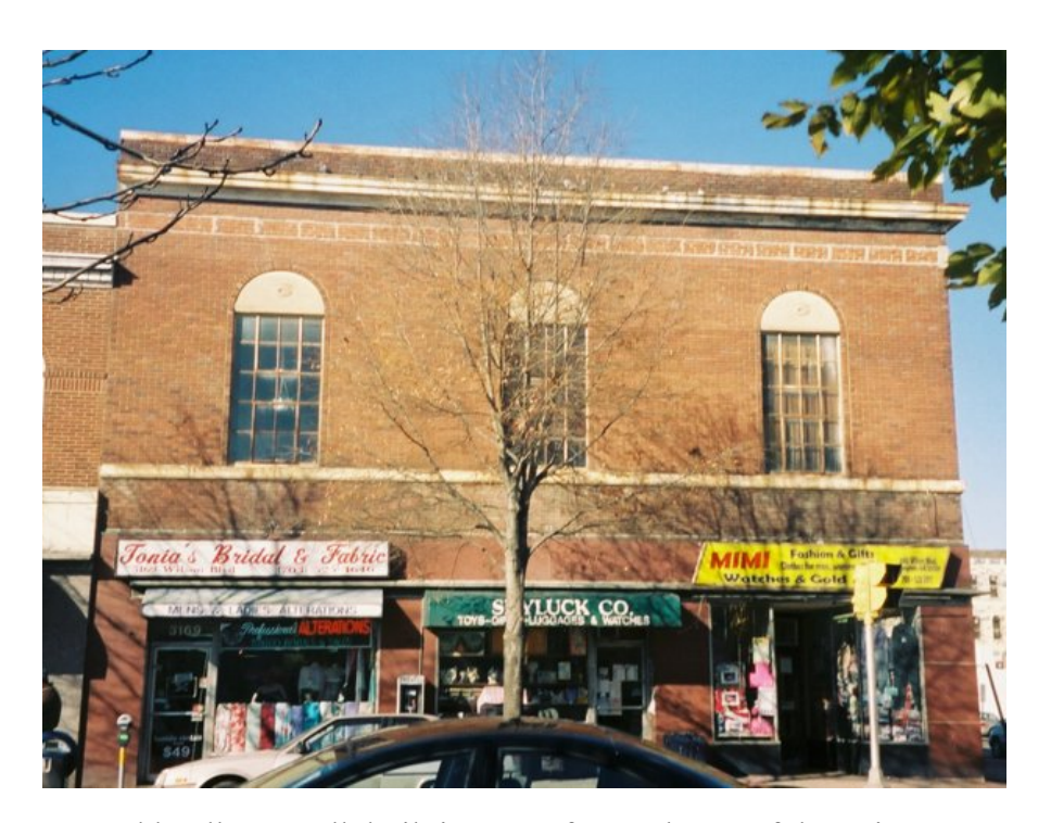
Figure 2. Odd Fellows Hall, built in 1925, former home of the Saigon Souvenir shop.